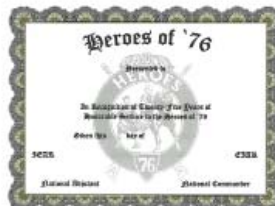
Item #166 $.50 ea. 25 Year Hero of '76 Certificate