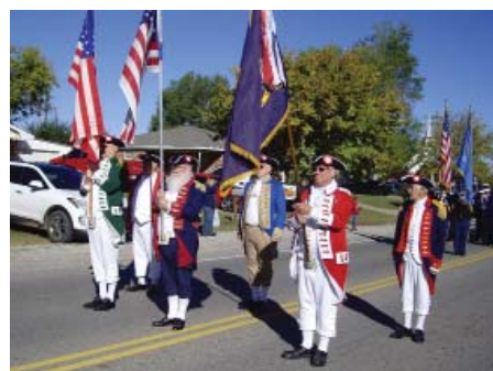
On November 11, 2013 our members presented the "Building of the Flag" program