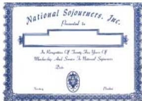
Item #164 $.25 or 5/$1.00 25 Year Sojourner Certificate